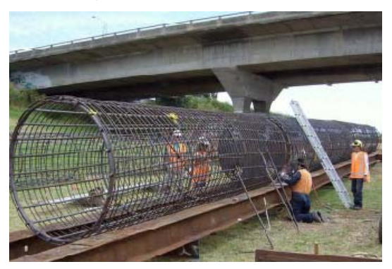
Welding O-cell Assembly to Reinforcing Cage

The initial fieldwork involved attaching a single 870 mm O-cell assembly to the steel reinforcing cage. Steel bearing plates welded to the top and bottom of the O-cell locate it in plan position and at the required elevation and distribute the load from the O-cell evenly to the concrete pile above and below.