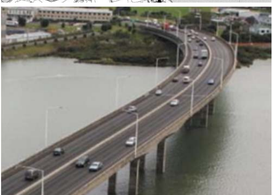
Existing Mangere Bridge Completed 1983

As a key member of the MHX Alliance, Fletcher Construction contacted the Loadtest Division of Fugro to carry out a full scale maintained load test on an 1800 mm diameter preliminary pile of depth exceeding 40m. The sub-surface stratigraphy at the location of the test pile comprised over 20 m of soft estuarine material overlying Sandstone bedrock characterized as extremely weak to weak with increasing depth.